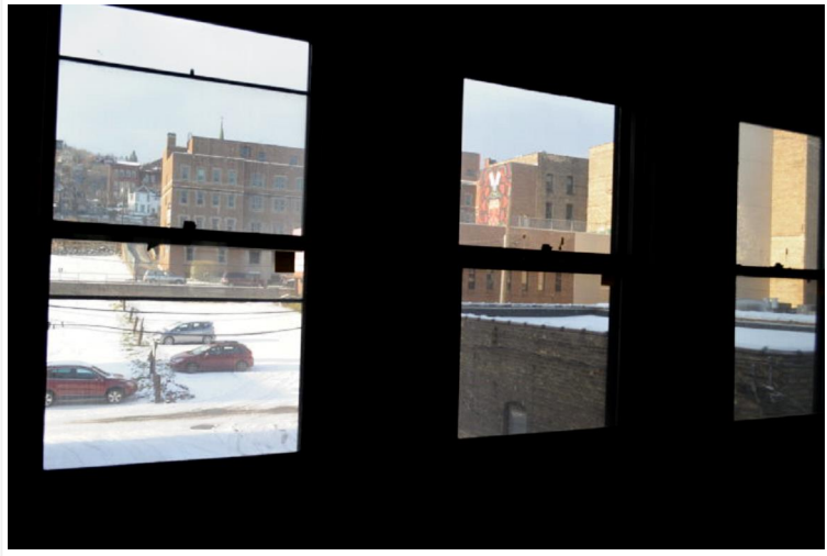
(https://2b9sqw2iiqxr36ntqa1exnal-wpengine.netdna-ssl.com/wpcontent/uploads/2017/11/DSC_0381.jpg) A third floor window bank offers hillside views of Downtown Duluth.

"We're going to appeal to young people, hikers, bikers, outdoorsy-types coming to this area to check out Duluth for a day or two," Monahan said. "If people want (privacy) there's 786 or whatever private rooms in Downtown Duluth so they can go there. This will be a different experience."